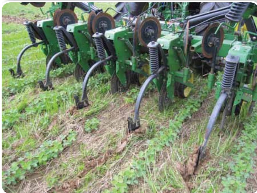
High-residue interrow cultivator cultivating soybean in a rolled rye system.

But the phenomenon isn’t unique to glyphosate or even to herbicides. Any weed-killing tactic, whether mechanical, chemical, or otherwise, will inevitably select for plants that can withstand it. The trick is to prevent or delay the evolution of