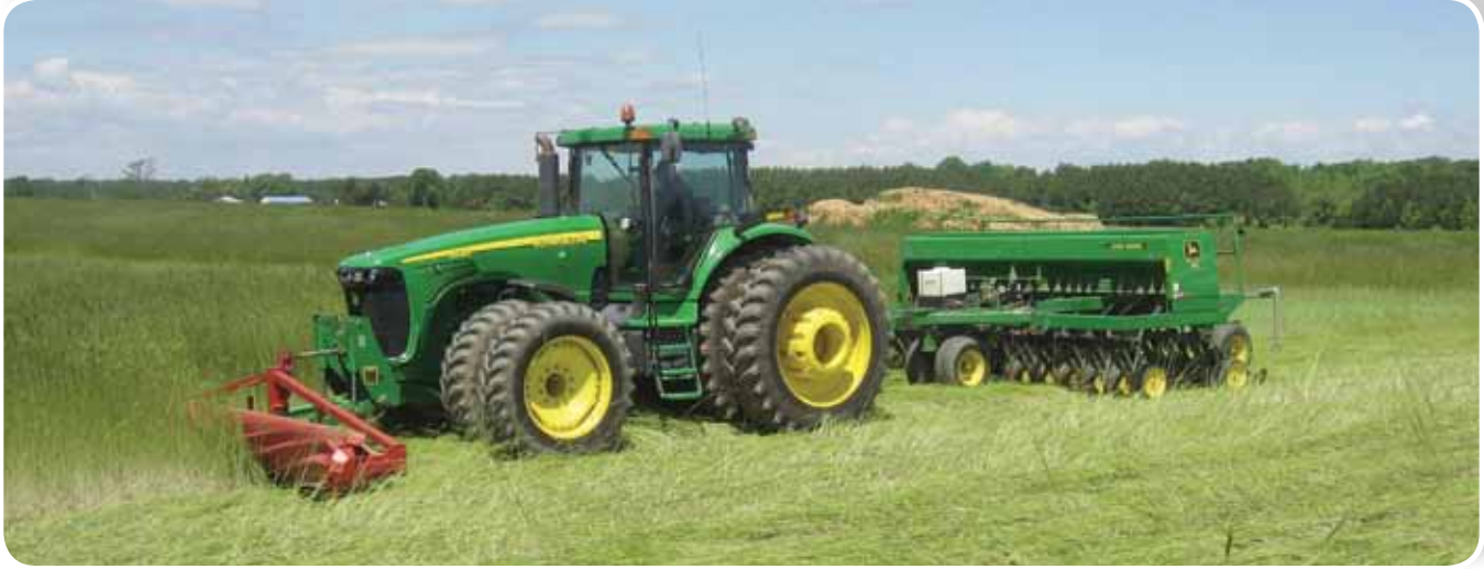
Organic farmer rolling rye and drilling soybean.

the weed-fighting work. In essence, “you’re using the mulch like a pre-emergence herbicide,” Curran says. “You’re hoping to get four, five, or six weeks of control.”