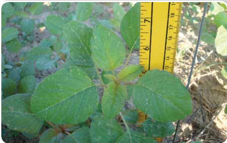
Because pigweed is so competitive against cotton, farmers in Georgia now use two or three residual herbicides at planting, plus another three more during the season to keep the weed from sprouting.