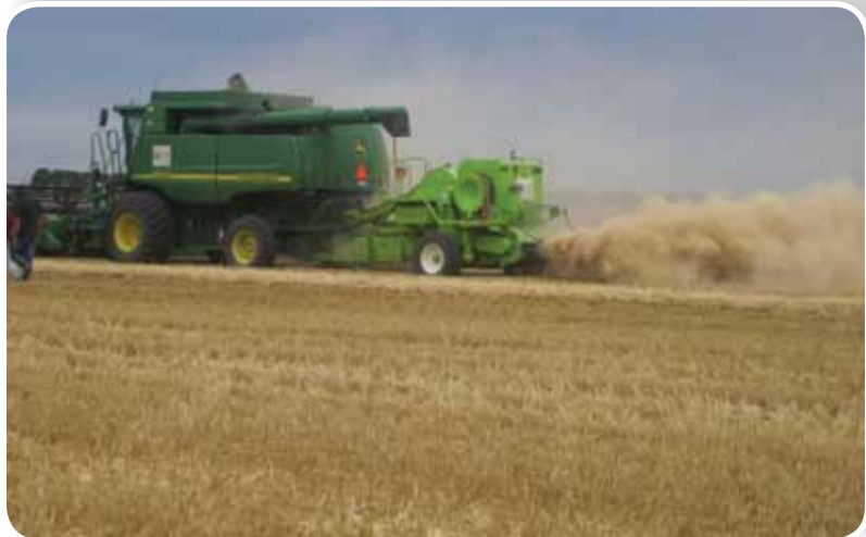
Instead of collecting weed seeds to be taken off site or burned, the Harrington seed destructor processes the weed seed-containing chaff fraction with a cage mill and spreads the material back on the soil.

Plus, it’s nice to exact a little revenge. “There’s something very gratifying about smashing weed seeds,” Walsh says.