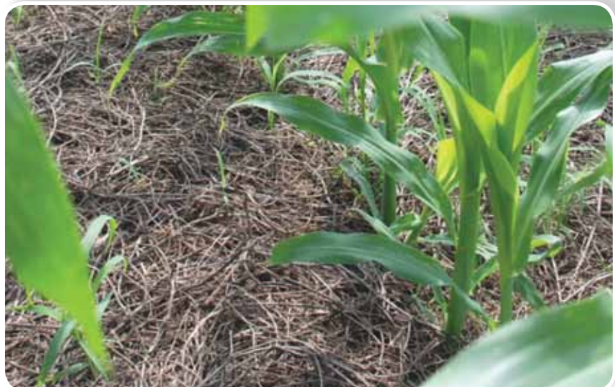
Corn no-till planted into a hairy vetch. The mulch helps suppress weeds for a period of time.

The idea is based in the “many little hammers” concept of ecological weed management, Ryan explains. Certain weed-fighting strategies are admittedly weak when used in isolation; for example, just increasing the seeding rate to make a crop more competitive against weeds “doesn’t